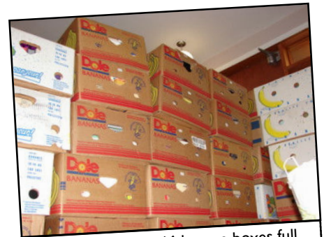
We shipped out 66 banana boxes full of Bibles and other Christian resources to the Christian Salvage Mission.