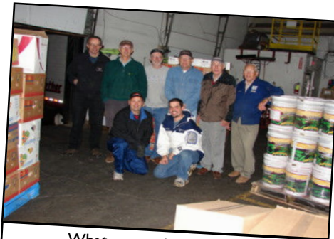
What a great bunch of guys. This is the crew that delivered the books for the Christian Salvage Mission. Thanks guys for all your help.