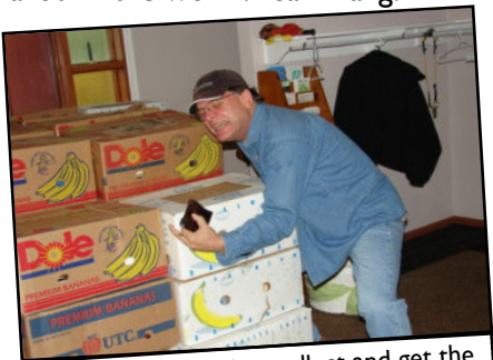
We worked hard to collect and get the boxes ready for delivery to the Christian Salvage Mission. Maybe some of us worked a little too hard.